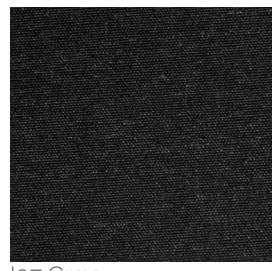
107 Gray 9654